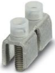
Fixed bridge, pitch: 20 mm, number of positions: 2, color: silver

Please be informed that the data shown in this PDF Document is generated from our Online Catalog. Please find the complete data in the user's documentation. Our General Terms of Use for Downloads are valid ( http://phoenixcontact.com/download )