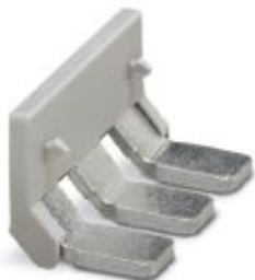
Insertion bridge, pitch: 25 mm, length: 38.9 mm, width: 68.3 mm, number of positions: 3, color: gray

Please be informed that the data shown in this PDF Document is generated from our Online Catalog. Please find the complete data in the user's documentation. Our General Terms of Use for Downloads are valid ( http://phoenixcontact.com/download )