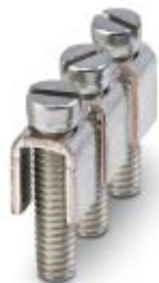
Fixed bridge, pitch: 8 mm, number of positions: 3, color: silver

Please be informed that the data shown in this PDF Document is generated from our Online Catalog. Please find the complete data in the user's documentation. Our General Terms of Use for Downloads are valid ( http://phoenixcontact.com/download )