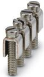
Fixed bridge, number of positions: 4, color: silver

Please be informed that the data shown in this PDF Document is generated from our Online Catalog. Please find the complete data in the user's documentation. Our General Terms of Use for Downloads are valid ( http://phoenixcontact.com/download )