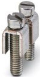
Fixed bridge, pitch: 8 mm, number of positions: 2, color: silver

Please be informed that the data shown in this PDF Document is generated from our Online Catalog. Please find the complete data in the user's documentation. Our General Terms of Use for Downloads are valid ( http://phoenixcontact.com/download )