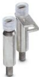
Switching jumper, pitch: 15 mm, number of positions: 2, color: silver

Please be informed that the data shown in this PDF Document is generated from our Online Catalog. Please find the complete data in the user's documentation. Our General Terms of Use for Downloads are valid ( http://phoenixcontact.com/download )