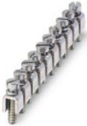
Fixed bridge, pitch: 10 mm, number of positions: 10, color: silver

Please be informed that the data shown in this PDF Document is generated from our Online Catalog. Please find the complete data in the user's documentation. Our General Terms of Use for Downloads are valid ( http://phoenixcontact.com/download )