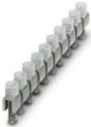
Fixed bridge, pitch: 12 mm, length: 7.5 mm, width: 118.4 mm, number of positions: 10, color: silver

Please be informed that the data shown in this PDF Document is generated from our Online Catalog. Please find the complete data in the user's documentation. Our General Terms of Use for Downloads are valid ( http://phoenixcontact.com/download )