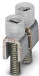
Fixed bridge, pitch: 10 mm, number of positions: 2, color: silver

Please be informed that the data shown in this PDF Document is generated from our Online Catalog. Please find the complete data in the user's documentation. Our General Terms of Use for Downloads are valid ( http://phoenixcontact.com/download )