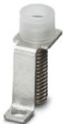
Step bracket, number of positions: 2, color: silver

Please be informed that the data shown in this PDF Document is generated from our Online Catalog. Please find the complete data in the user's documentation. Our General Terms of Use for Downloads are valid ( http://phoenixcontact.com/download )