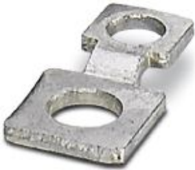
Step bracket, pitch: 5 mm, number of positions: 2, color: silver

Please be informed that the data shown in this PDF Document is generated from our Online Catalog. Please find the complete data in the user's documentation. Our General Terms of Use for Downloads are valid ( http://phoenixcontact.com/download )