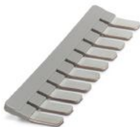
Insertion bridge, pitch: 15 mm, number of positions: 10, color: gray

Please be informed that the data shown in this PDF Document is generated from our Online Catalog. Please find the complete data in the user's documentation. Our General Terms of Use for Downloads are valid ( http://phoenixcontact.com/download )