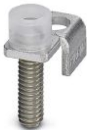
Chain bridge, pitch: 15 mm, number of positions: 1, color: silver

Please be informed that the data shown in this PDF Document is generated from our Online Catalog. Please find the complete data in the user's documentation. Our General Terms of Use for Downloads are valid ( http://phoenixcontact.com/download )