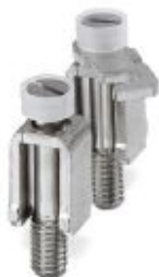
Switching jumper, pitch: 15 mm, number of positions: 2, color: silver

Please be informed that the data shown in this PDF Document is generated from our Online Catalog. Please find the complete data in the user's documentation. Our General Terms of Use for Downloads are valid ( http://phoenixcontact.com/download )