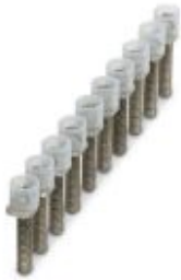
Jumper, pitch: 8 mm, number of positions: 10, color: silver

Please be informed that the data shown in this PDF Document is generated from our Online Catalog. Please find the complete data in the user's documentation. Our General Terms of Use for Downloads are valid ( http://phoenixcontact.com/download )