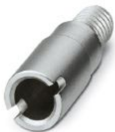
Female test connector, color: silver

Please be informed that the data shown in this PDF Document is generated from our Online Catalog. Please find the complete data in the user's documentation. Our General Terms of Use for Downloads are valid ( http://phoenixcontact.com/download )