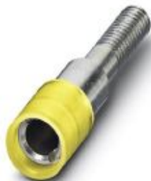
Female test connector, color: yellow

Please be informed that the data shown in this PDF Document is generated from our Online Catalog. Please find the complete data in the user's documentation. Our General Terms of Use for Downloads are valid ( http://phoenixcontact.com/download )