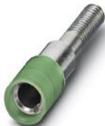
Female test connector, color: green

Please be informed that the data shown in this PDF Document is generated from our Online Catalog. Please find the complete data in the user's documentation. Our General Terms of Use for Downloads are valid ( http://phoenixcontact.com/download )