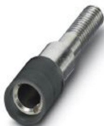
Female test connector, color: black

Please be informed that the data shown in this PDF Document is generated from our Online Catalog. Please find the complete data in the user's documentation. Our General Terms of Use for Downloads are valid ( http://phoenixcontact.com/download )