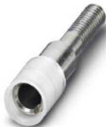
Female test connector, color: transparent

Please be informed that the data shown in this PDF Document is generated from our Online Catalog. Please find the complete data in the user's documentation. Our General Terms of Use for Downloads are valid ( http://phoenixcontact.com/download )