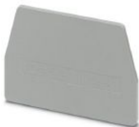
End cover, length: 61 mm, width: 2.2 mm, height: 41.5 mm, color: gray

Please be informed that the data shown in this PDF Document is generated from our Online Catalog. Please find the complete data in the user's documentation. Our General Terms of Use for Downloads are valid ( http://phoenixcontact.com/download )