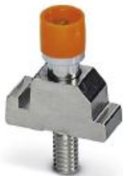
Slide, color: silver

Please be informed that the data shown in this PDF Document is generated from our Online Catalog. Please find the complete data in the user's documentation. Our General Terms of Use for Downloads are valid ( http://phoenixcontact.com/download )