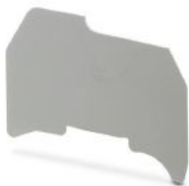
Separating plate, width: 0.8 mm, color: gray

Please be informed that the data shown in this PDF Document is generated from our Online Catalog. Please find the complete data in the user's documentation. Our General Terms of Use for Downloads are valid ( http://phoenixcontact.com/download )