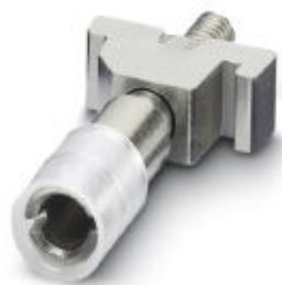
Female test connector, color: gray

Please be informed that the data shown in this PDF Document is generated from our Online Catalog. Please find the complete data in the user's documentation. Our General Terms of Use for Downloads are valid ( http://phoenixcontact.com/download )