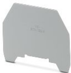
Separating plate, length: 61 mm, width: 0.8 mm, color: gray

Please be informed that the data shown in this PDF Document is generated from our Online Catalog. Please find the complete data in the user's documentation. Our General Terms of Use for Downloads are valid ( http://phoenixcontact.com/download )