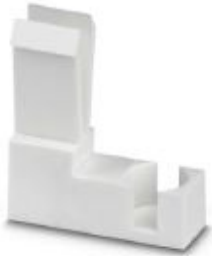
Switching lock, for disconnect slides, length: 12 mm, width: 8.2 mm, color: white

Please be informed that the data shown in this PDF Document is generated from our Online Catalog. Please find the complete data in the user's documentation. Our General Terms of Use for Downloads are valid ( http://phoenixcontact.com/download )