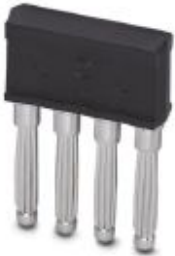
Short-circuit connector, pitch: 8 mm, number of positions: 4, color: black

Please be informed that the data shown in this PDF Document is generated from our Online Catalog. Please find the complete data in the user's documentation. Our General Terms of Use for Downloads are valid ( http://phoenixcontact.com/download )