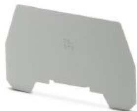
Partition plate, length: 72 mm, width: 0.8 mm, color: gray

Please be informed that the data shown in this PDF Document is generated from our Online Catalog. Please find the complete data in the user's documentation. Our General Terms of Use for Downloads are valid ( http://phoenixcontact.com/download )