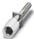
Female test connector, color: red

Female test connector - PSBJ 3,5/18/6 RD - 0311320