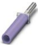
Female test connector, color: violet

Female test connector - PSBJ-URTK/S VT - 0311773