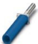
Female test connector, color: blue

Female test connector - PSBJ-URTK/S BU - 0311757