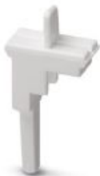
Switching lock, length: 12 mm, width: 8.2 mm, color: white

Please be informed that the data shown in this PDF Document is generated from our Online Catalog. Please find the complete data in the user's documentation. Our General Terms of Use for Downloads are valid ( http://phoenixcontact.com/download )