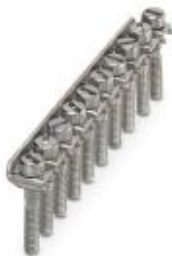
Screw bridge, pitch: 8.2 mm, number of positions: 10, color: silver

Please be informed that the data shown in this PDF Document is generated from our Online Catalog. Please find the complete data in the user's documentation. Our General Terms of Use for Downloads are valid ( http://phoenixcontact.com/download )