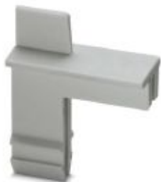
Switching lock, length: 18.8 mm, width: 7.9 mm, height: 21.5 mm, color: white

Please be informed that the data shown in this PDF Document is generated from our Online Catalog. Please find the complete data in the user's documentation. Our General Terms of Use for Downloads are valid ( http://phoenixcontact.com/download )