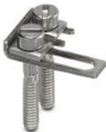
Switching jumper, pitch: 8.2 mm, number of positions: 2, color: silver

Please be informed that the data shown in this PDF Document is generated from our Online Catalog. Please find the complete data in the user's documentation. Our General Terms of Use for Downloads are valid ( http://phoenixcontact.com/download )