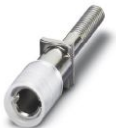
Female test connector, color: transparent

Please be informed that the data shown in this PDF Document is generated from our Online Catalog. Please find the complete data in the user's documentation. Our General Terms of Use for Downloads are valid ( http://phoenixcontact.com/download )