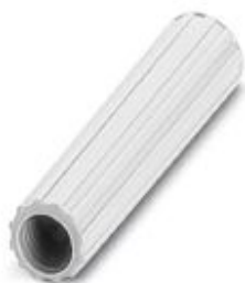
Insulating sleeve, color: white

Please be informed that the data shown in this PDF Document is generated from our Online Catalog. Please find the complete data in the user's documentation. Our General Terms of Use for Downloads are valid ( http://phoenixcontact.com/download )