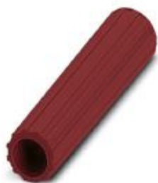
Insulating sleeve, color: red

Please be informed that the data shown in this PDF Document is generated from our Online Catalog. Please find the complete data in the user's documentation. Our General Terms of Use for Downloads are valid ( http://phoenixcontact.com/download )