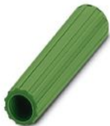
Insulating sleeve, color: green

Please be informed that the data shown in this PDF Document is generated from our Online Catalog. Please find the complete data in the user's documentation. Our General Terms of Use for Downloads are valid ( http://phoenixcontact.com/download )