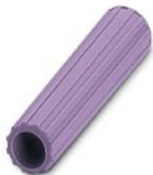
Insulating sleeve, color: violet

Please be informed that the data shown in this PDF Document is generated from our Online Catalog. Please find the complete data in the user's documentation. Our General Terms of Use for Downloads are valid ( http://phoenixcontact.com/download )