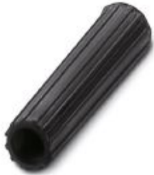
Insulating sleeve, color: black

Please be informed that the data shown in this PDF Document is generated from our Online Catalog. Please find the complete data in the user's documentation. Our General Terms of Use for Downloads are valid ( http://phoenixcontact.com/download )