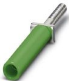
Female test connector, color: green

Please be informed that the data shown in this PDF Document is generated from our Online Catalog. Please find the complete data in the user's documentation. Our General Terms of Use for Downloads are valid ( http://phoenixcontact.com/download )