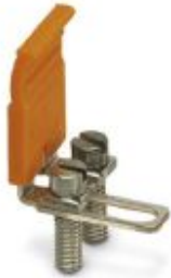
Switching jumper, pitch: 8.2 mm, number of positions: 2, color: silver

Please be informed that the data shown in this PDF Document is generated from our Online Catalog. Please find the complete data in the user's documentation. Our General Terms of Use for Downloads are valid ( http://phoenixcontact.com/download )