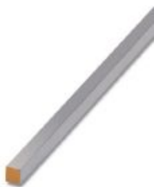
Neutral busbar, width: 6 mm, height: 6 mm, material: Copper, tin-plated, length: 2000 mm, color: silver

Please be informed that the data shown in this PDF Document is generated from our Online Catalog. Please find the complete data in the user's documentation. Our General Terms of Use for Downloads are valid ( http://phoenixcontact.com/download )