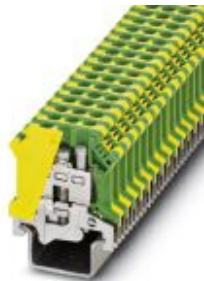
Ground terminal block with screw connection, cross section: 0.5 ... 6 mm 2 , AWG: 20 ... 8, width: 8.2 mm, color: green...yellow

Please be informed that the data shown in this PDF Document is generated from our Online Catalog. Please find the complete data in the user's documentation. Our General Terms of Use for Downloads are valid ( http://phoenixcontact.com/download )