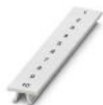
Zack marker strip, Strip, white, labeled, can be labeled with: CMS-P1-PLOTTER, Printed vertically: consecutive numbers 1 ... 10, 11 ... 20, etc. up to 491 ... 500, mounting type: snap into tall marker groove, for terminal block width: 6.2 mm, lettering field size: 6.15 x 10.5 mm, Number of individual labels: 10

Zack marker strip - ZB 6,QR:FORTL.ZAHLEN - 1051029