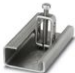
End clamp, width: 8 mm