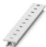
Zack marker strip, Strip, white, labeled, can be labeled with: CMS-P1-PLOTTER, printed horizontally: consecutive numbers 1 ... 10, 11 ... 20, etc. up to 491 ... 500, mounting type: snap into tall marker groove, for terminal block width: 6.2 mm, lettering field size: 6.15 x 10.5 mm, Number of individual labels: 10

Zack marker strip - ZB 6,LGS:FORTL.ZAHLEN - 1051016