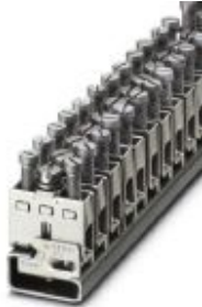
Ground modular terminal block, connection method: Screw connection, number of connections: 2, cross section: 0.5 mm 2 - 16 mm 2 , AWG: 20 - 6, width: 10 mm, color: silver, mounting type: NS 32

Please be informed that the data shown in this PDF Document is generated from our Online Catalog. Please find the complete data in the user's documentation. Our General Terms of Use for Downloads are valid ( http://phoenixcontact.com/download )