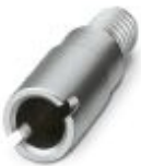
Female test connector, color: silver

Female test connector - PSB 4/7/6 - 0303299