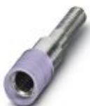
Female test connector, color: violet

Female test connector - PSBJ 4/15/6 VT - 0303383