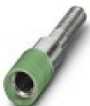
Female test connector, color: green

Female test connector - PSBJ 4/15/6 GN - 0303370