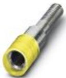
Female test connector, color: yellow

Female test connector - PSBJ 4/15/6 YE - 0303367