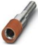
Female test connector, color: red

Female test connector - PSBJ 4/15/6 RD - 0303325