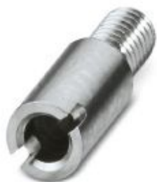
Female test connector, color: silver

Please be informed that the data shown in this PDF Document is generated from our Online Catalog. Please find the complete data in the user's documentation. Our General Terms of Use for Downloads are valid ( http://phoenixcontact.com/download )