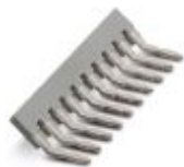
Insertion bridge, pitch: 6.2 mm, number of positions: 10, color: gray