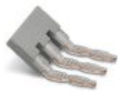
Insertion bridge, pitch: 6.2 mm, number of positions: 3, color: gray