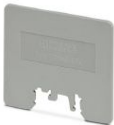
Partition plate, length: 80 mm, width: 2 mm, height: 70 mm, color: gray

Please be informed that the data shown in this PDF Document is generated from our Online Catalog. Please find the complete data in the user's documentation. Our General Terms of Use for Downloads are valid ( http://phoenixcontact.com/download )