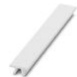
Zack marker strip, Strip, white, unlabeled, can be labeled with: PLOTMARK, CMS-P1-PLOTTER, mounting type: snap into tall marker groove, for terminal block width: 16 mm, lettering field size: 16 x 10.5 mm, Number of individual labels: 50

Zack marker strip - ZB 16:UNPRINTED - 0827461