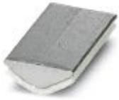
Insertion profile, color: silver